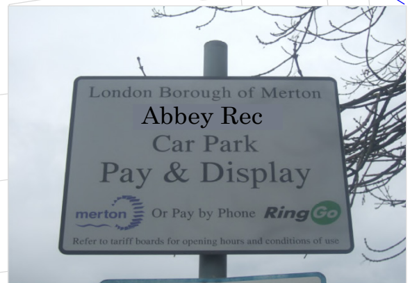
PROPOSED NEW SIGN ON THE MAIN GATE