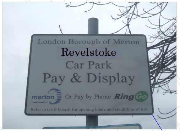
PROPOSED NEW SIGN ON THE MAIN GATE