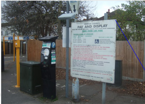
PROPOSED NEW PAY AND DISPLAY MACHINE AND SIGNS