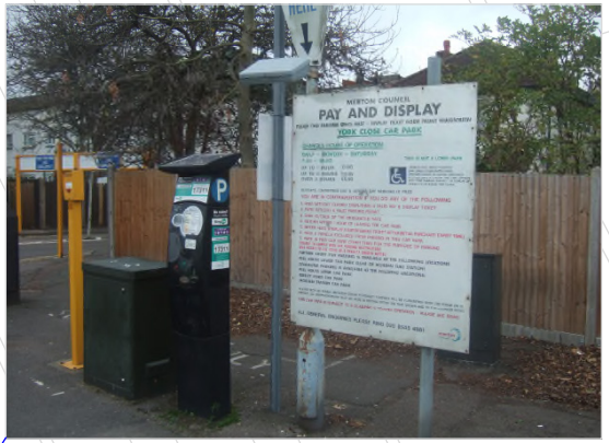
PROPOSED NEW PAY AND DISPLAY MACHINE AND SIGNS