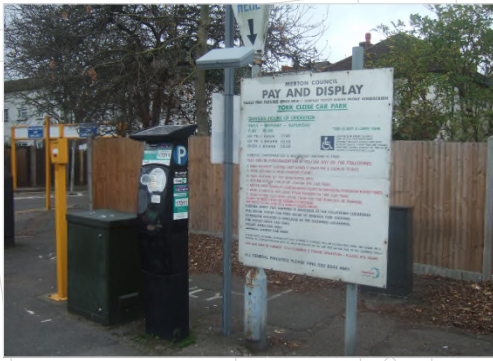
PROPOSED NEW PAY AND DISPLAY MACHINE AND SIGNS