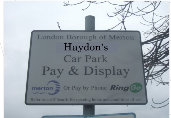
PROPOSED NEW SIGN ON THE MAIN GATE