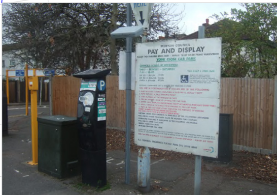
PROPOSED NEW PAY AND DISPLAY MACHINE AND SIGNS