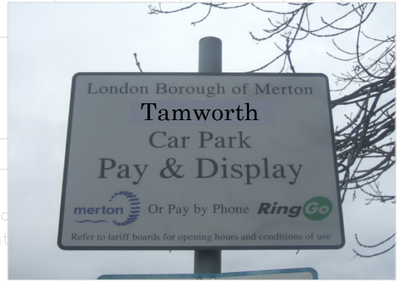
PROPOSED NEW SIGN ON THE MAIN GATE