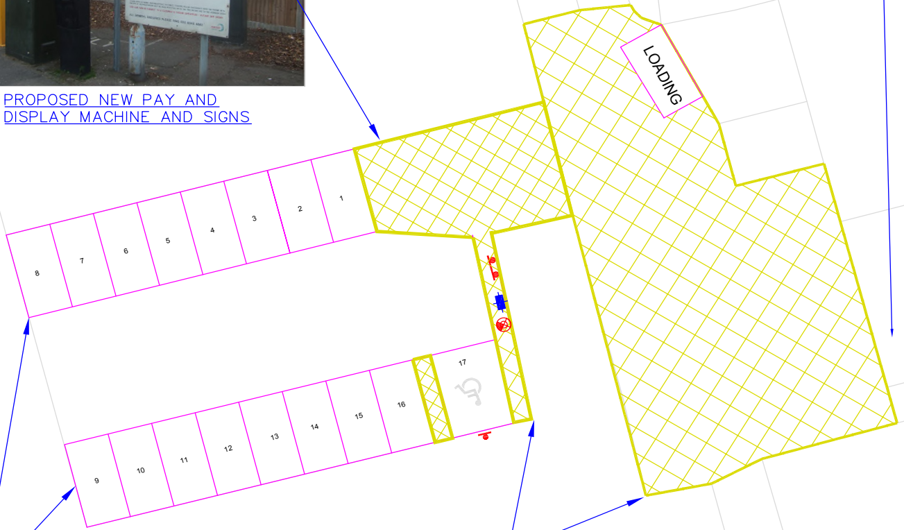
NEW ROAD MARKINGS TO BE MARKED AS SHOWN ON THE PLAN